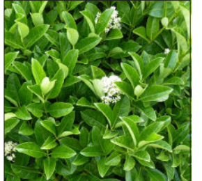
VIBURNUM odoratissimum LARGE SHRUB